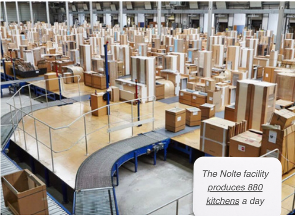
The Nolte facility produces 880 kitchens a day